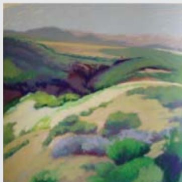
Alexia Scott's White Rock Valley

In these works, she starts with a strong sense of form. The elements of the landscape are enhanced to create compositionally a feeling of equilibrium, harmony, and well-being. As she reduces the image to lines of movement and utilizes a palette that pulls the eye into deep space, she attempts to create a meditative calming state in the viewer. The process creates a new convincing reality of the place—the image appears refined but is actually a careful expression of the subject.