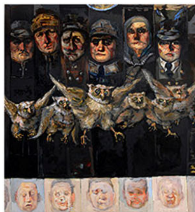
Diary of War