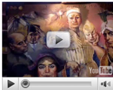
CMDupré Interview 2008

In May 2009, Dupré embarked on studies for the doctorate in visual arts in Italy. She was accepted into the graduate program at the Institute for