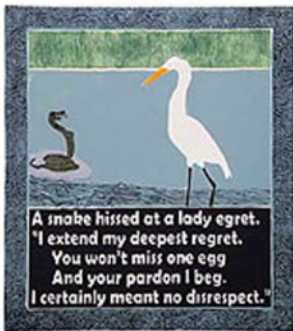
Egret by Phyllis Cohen

Covey was also one of ten artists selected to be part of Arthouse1, an art and film event which was held on May 16 in Washington, DC. The event included a feature film selected by the Washington Film Institute and multimedia projections and installations curated by Art Outlet.