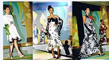
Batik Wearable Art Fashion Show, May 20 at 7pm

Join the Friends. Membership starts at just $35.