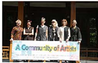
Torpedo Factory artists in Seoul, Korea