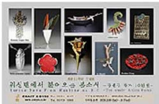
Jewelry Exhibition in Seoul, Korea