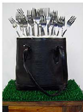
Weapons of Mass Consumption by Rosemary Luckett

Rosemary Luckett's collage painting Crossroads at Sea is included in the Union of Concerned Scientists Earth in the Balance exhibit, 1825 K St., NW, Washington, DC, through October. Her sculpture Weapons of Mass Consumption appears in the Target Gallery Reclaimed exhibit April 1 - 28. Two works are included in the Torpedo Factory traveling exhibition From Here 2 There through August 2009.